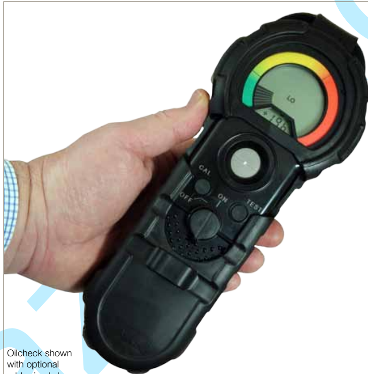
Oilcheck shown with optional rubberized sleeve.

Parker's Oilcheck is completely portable and battery powered with a numerical display that indicates positive or negative increase in dielectrics. Oilcheck gives an early warning of impending engine failure and the simplistic hand-held design makes it easy to use.