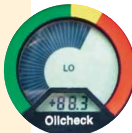
Green/amber/red numerical value